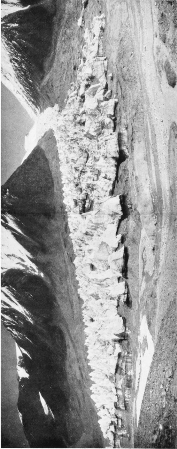
Seracs of a glacier on south side of Lungmo Che (Valley I), tributary of Yarkand River from the west