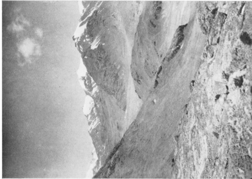
Looking up Valley B towards source of Yarkand river